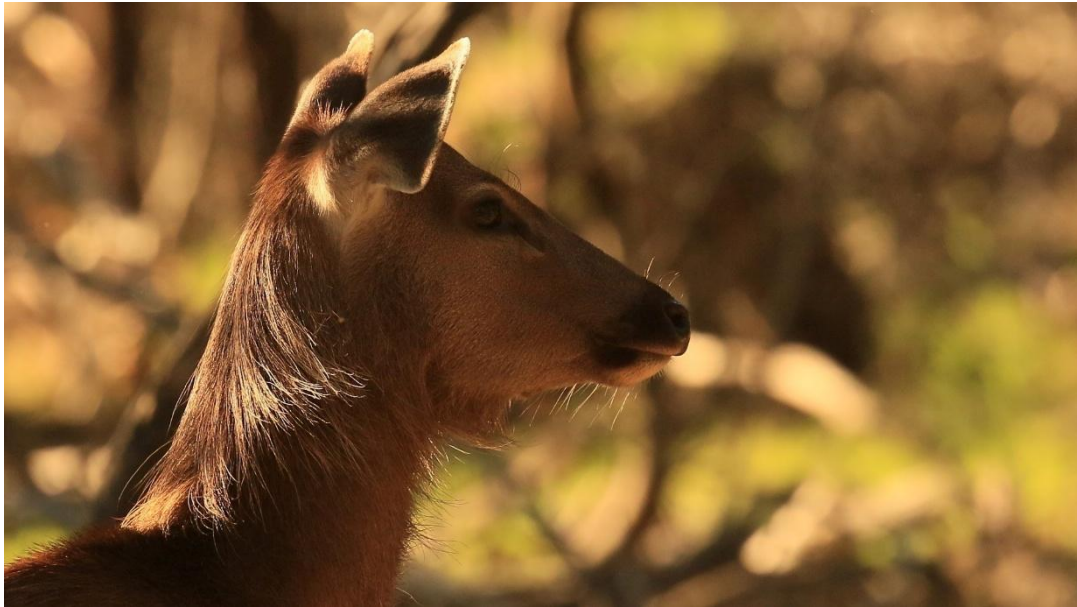
Sambar hind close up