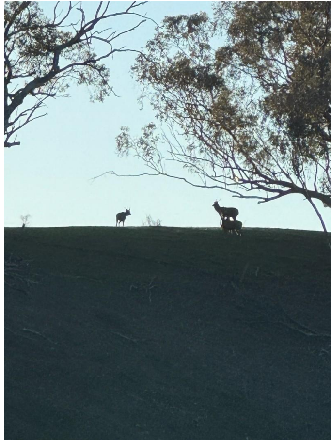
Derek took this pic of a small herd seen on 30 August.