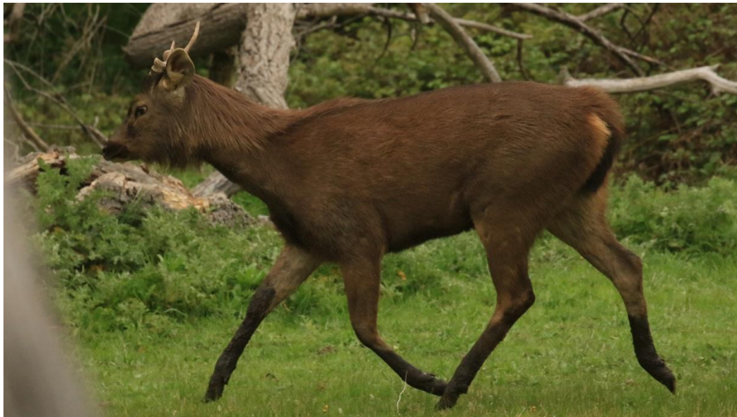
Young sambar stag on the trot