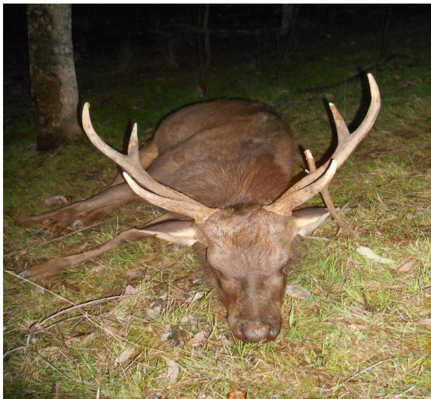
Dereks young big-body small-head stag taken on 6 Sept.