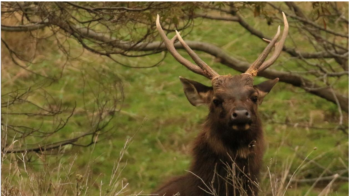
Sambar Stag