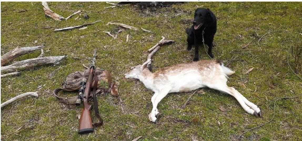
Derek with a Young fallow doe taken 10:15am Wednesday 24th. A 2km carry-out followed.