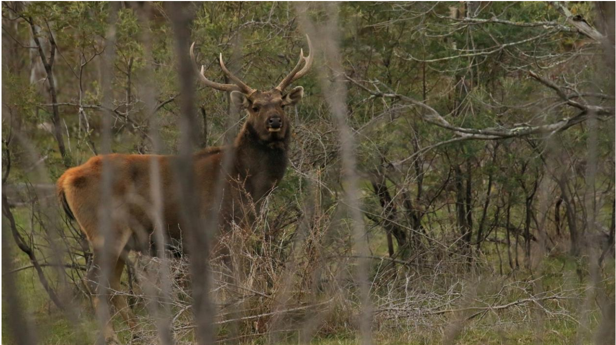
Good example of a Mature sambar stag