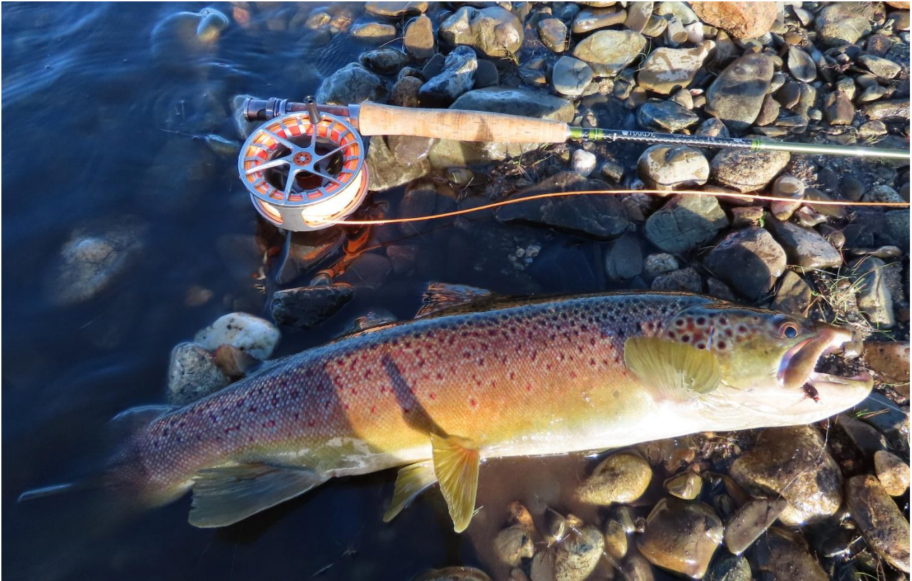
The upper Eucumbene River. Good grasshopper water in the summer. That sounds like a good excuse for another trip.