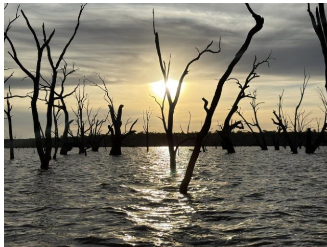
Rocklands May 2025