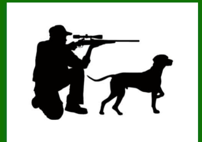
Dog & Gun coffee