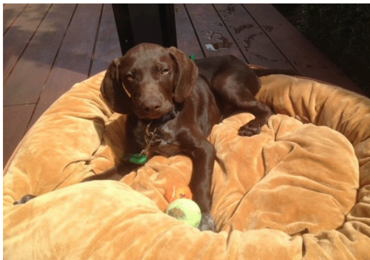
3 month old Rip

He knew a shooter that had a bitch with papers that he put his champion dog over. The bitch was used for hunting and was said to be a good worker. He had sold all of his pups out of the last litter to accept for one which he had kept for himself. The pup was three months old and lived in a small back yard with it's mother. The man's wife said that the yard is only big enough for one dog and the pup must go, so I bought him on the spot.