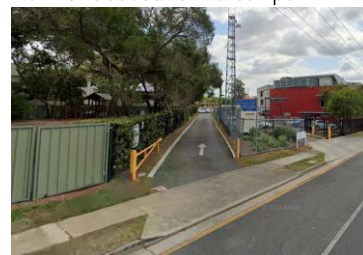
Kent St access to the car park

7pm Supper, drinks and catch up. President's welcome. Treasurer's report. Guest presentation Hunts past and planned. USB drive your pictures so that we can put them up on the screen. Lucky door prize (sponsored). Meeting close, no later than 10pm.